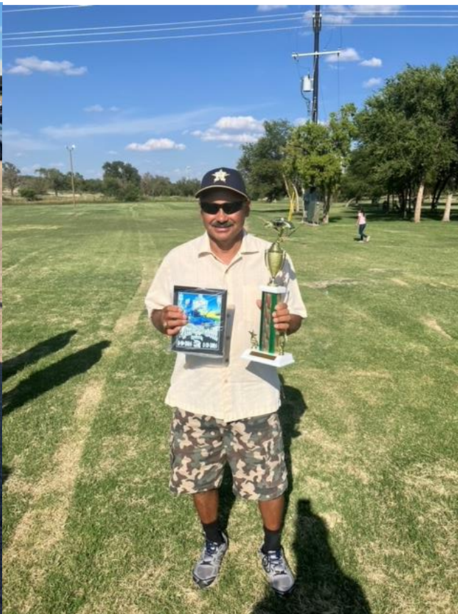
Plus...See Tommy/Linda's emails!