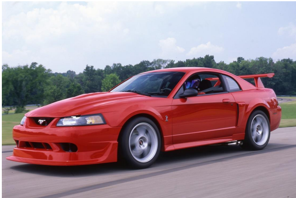
2000 Ford SVT Mustang Cobra

11 of the Coolest Ford Mustangs Ever Made As chosen by the Motor Trend staff